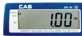
Lb - SW & SW-N