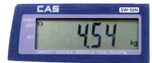
Kg - SW & SW-N